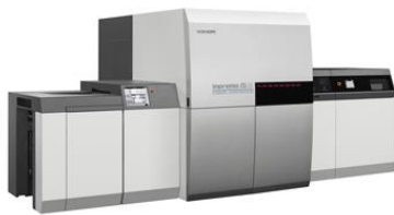
photo: Impremia IS29

The possibilities of offset printing's essence, art and expression. Business model ideas and samples of added value printing will be displayed. Printing methods and key points will be introduced.